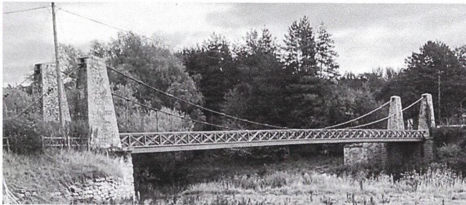
Figure 1 – Elevation view of bridge from west bank

Kalemouth Suspension Bridge is a nationally important Category A listed structure. It was designed by Captain Samuel Brown and built in around 1835 and is the last remaining chain-bar suspension bridge in Scotland with the majority of its original ironwork still intact. It spans over the River Teviot and is one of the earliest examples of a wrought iron chain suspension bridge in the United Kingdom. A recent view of the bridge is shown below.