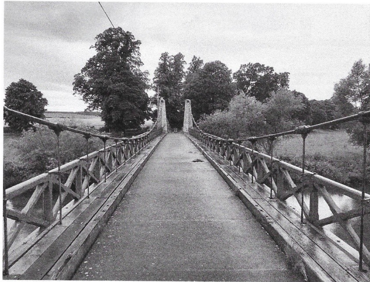
Figure 2 – View of bridge deck showing anti-slip surfacing

To allow the refurbishment works to progress, advance works will take place later this month, targeted for w/c 23 rd February, to remove parts of the bridge deck that currently create suitable habitat for summer bat roosts. Due to the nature of these works, a full bridge closure will be necessary to ensure the safety of the public and workforce alike – works are expected to take approximately one week. This licenced work needs to take place before bats return in the spring and involves removing the top anti-slip surface of the bridge deck. A photo of the existing deck arrangement is shown below.